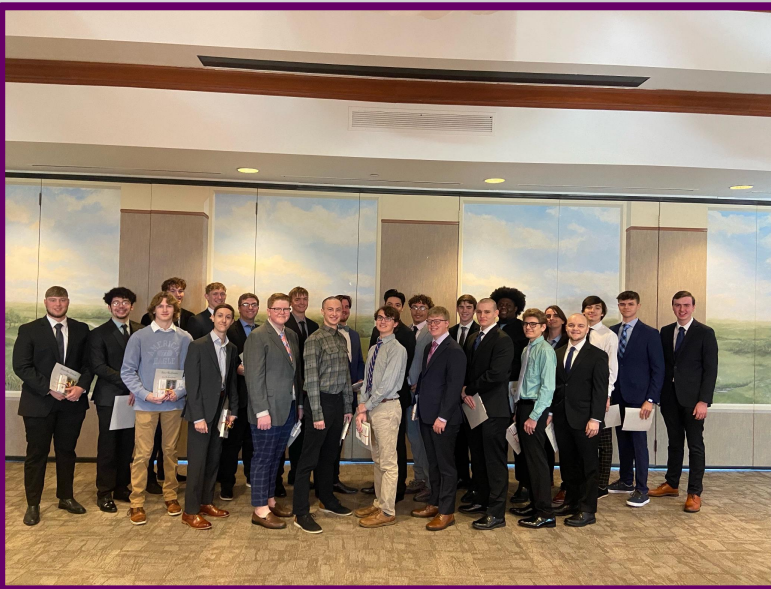
Pictured: Left: The men of IN Zeta and all BMS Finalists Above This year's BMS Finalists.