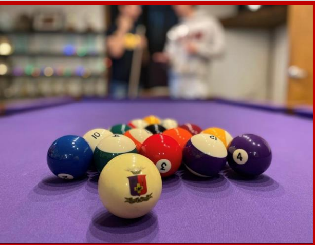
Left: Brother Noah Godsell gets hyped up after an upset win