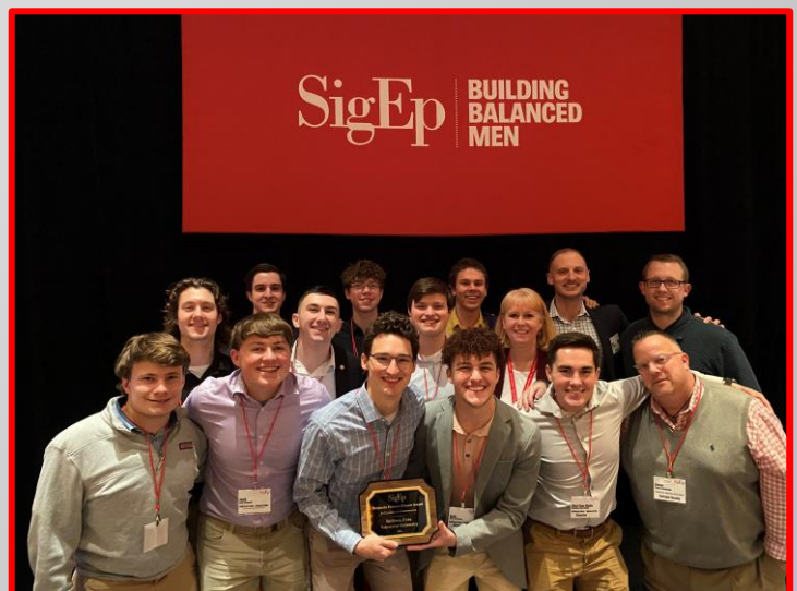
Right: Brothers and mentors accepting an award at Carlson Leadership Academy