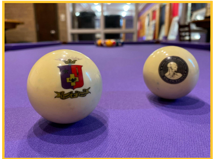
Below. Our two new cue balls.

The newly named "Corner Pocket" still has some work to be done, but has been utilized in the way that we intended. Brothers have invited friends, girlfriends, and family into a more welcoming facility. We also anticipate holding recruitment and brotherhood events revolving around the pool table. We look forward to the many memories the pool table will provide us, just as the bar did.