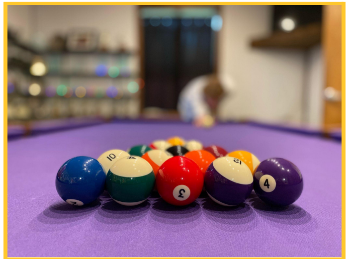
Above. Our new set of pool balls.