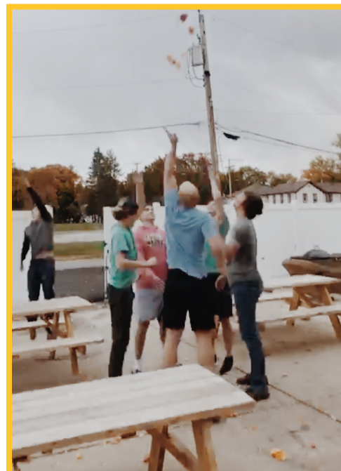
Left: Brothers smash- ing pump- kins.